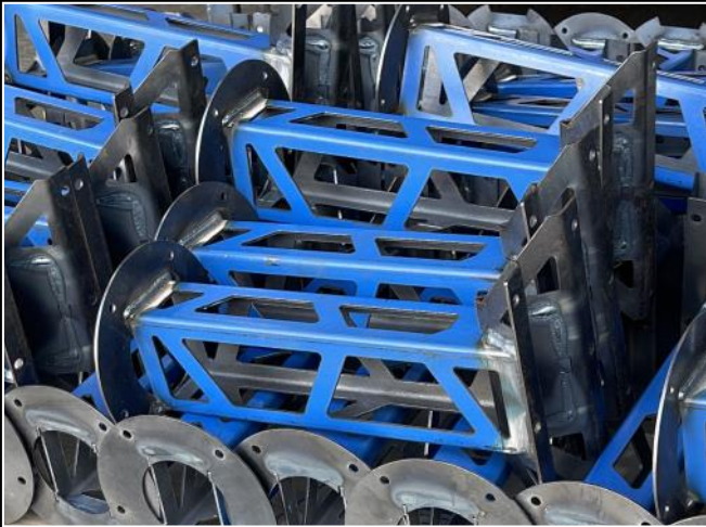
Plate & 3D Tube Laser Cutting

Aim laser offer full service laser cutting of all grades of steel, aluminium, stainless steel and gal in both tubular and plate profiles. Our Toowoomba workshop can process most plate metals up to 40mm thickness and all tubular profiles including SHS, CHS, RHS, Angle and PFC (see details over page). Our 180 tonne, 4m brake press can press most parts we cut.